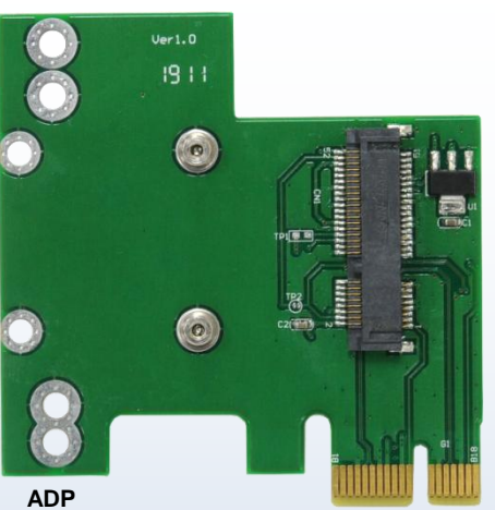
(Mini PCI-E / PCI-E adapter ver1.0) x1