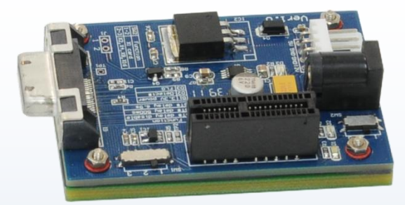
DB5L (PCIE x1 to PCI express adapter) x1