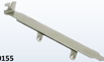
JP0155 (Standard Height PCI Express bracket) x1