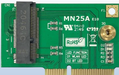
MN25A (M.2 E key card to mPCIe Adapter) x1