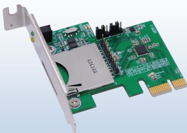
MP220 SDXC UHS-I & SDIO2.0/1.8V PCIe Reader x1