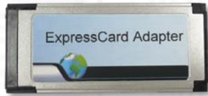
◆ EC2C (Express card to the converted port adapter) x1