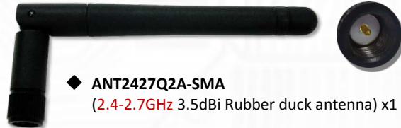
◆ ANT2427Q2A-SMA (2.4-2.7GHz 3.5dBi Rubber duck antenna) x1