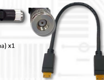
◆ PCIEMM-030 (Custom PCIe Male to Male 30cm)

As a New manufacturer of quality computer connectivity products since 2009/Mar, BPLUS technology brings to market a broad range of upgrade products. These products bridge the connection between Desktop/Notebook systems and external peripherals.