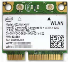
◆ 622ANXHMW (Intel® Centrino® Advanced-N + WiMAX 6250) x1