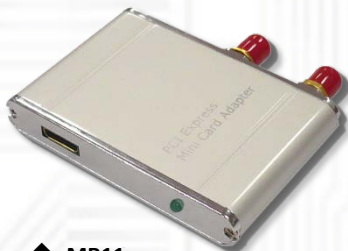
◆ MR11 (mPCIe passive adapter ver1.0) x1