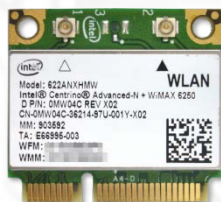
◆ 622ANXHMW (Intel® Centrino® Advanced-N + WiMAX 6250) x1