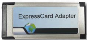
◆ EC2C (Express card to the converted port adapter) x1