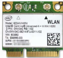
◆ 622ANXHMW (Intel® Centrino® Advanced-N + WiMAX 6250) x1