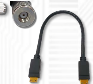
◆ PCIEMM-030 (Custom PCIe Male to Male 30cm) x1