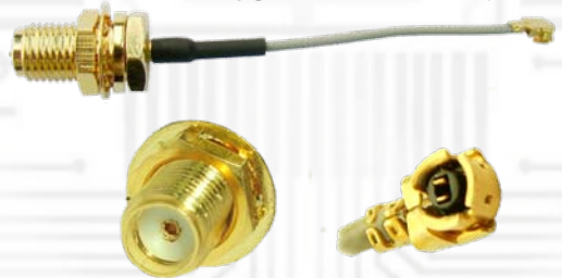
U.fl / IPX to SMA female pigtail for wifi RF cable adapter

As a New manufacturer of quality computer connectivity products since 2009/Mar, BPLUS technology brings to market a broad range of upgrade products. These products bridge the connection between Desktop/Notebook systems and external peripherals.