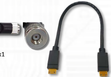
◆ PCIEMM-030 (Custom PCIe Male to Male 30cm) x1