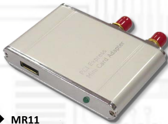
◆ MR11 (mPCIe passive adapter ver1.0) x1