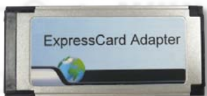
◆ EC2C (Express card to the converted port adapter) x1