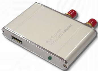
◆ MR11 (mPCIe passive adapter ver1.0) x1