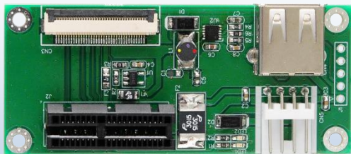
P24F PCIe x1 slot (edge) x1