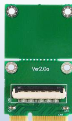
P24S mPCIe head (gold finger) x1