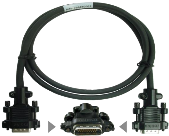
molex 799250001 cable