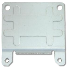
Metal Baffle x1 (Half to Full minicard bracket)