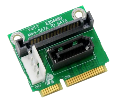
PMMD V1.1 (SATA to half mSATA adapter with SATA power) x1