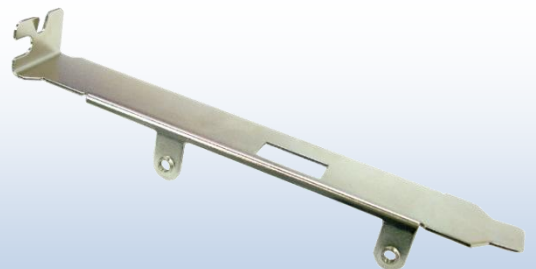
Standard Height PCI express bracket x1

As a New manufacturer of quality computer connectivity products since 2009/Mar, BPLUS technology brings to market a broad range of upgrade products. These products bridge the connection between Desktop/Notebook systems and external peripherals.