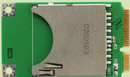
MR04 V3.0 (MiniCardAdapter for SD card) x1