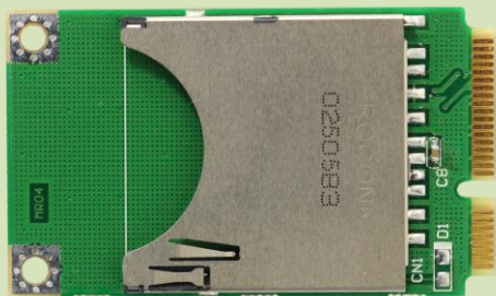
MR04 V3.0 (MiniCardAdapter for SD card) x1